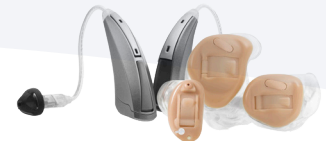
Four Styles of Hearing Aids

Live Speech Mapping is a new technology for fitting hearing aids that produces higher satisfaction. As the patient listens to live speech from a spouse or someone they are familiar with, an advanced computer measures and records the hearing aids' performance at the patient's eardrum. This system allows the clinician to precisely set and adjust the prescription for the best hearing possible.