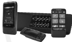
SURFLINK 900 MHz

Adjust your hearing aids with the TruLink app or our TruLink Remote